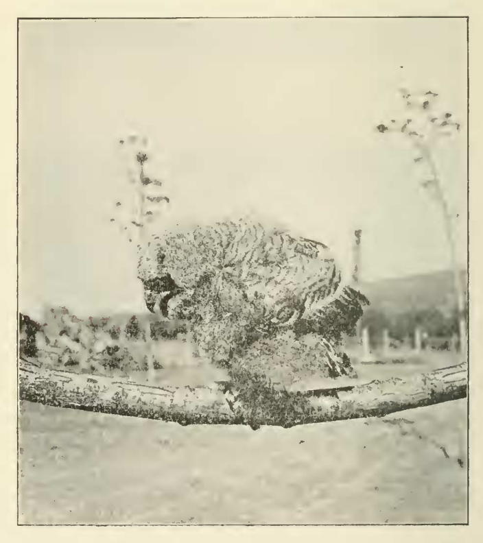
YOUNG WESTERN HORNED OWL.

I visited the nesting site in April of the following year. An empty egg shell proved that the nest was occupied again. Returning on the 13th we found the post ready set. The old bird was on the nest when I started down, but soon flew away. In the nest were three downy young, with pin feathers just beginning to show in the largest bird. There were also three young Pinon Jays, a Pocket Gopher (Thomomys), and the hind quarters of a cotton-tail rabbit, all food for the young.